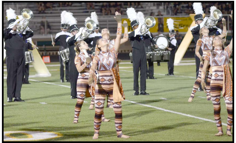
DCHS Color Guard and Band perform at Greenwood High School

DCHS Band traveled to Greenwood on September 23rd for their first competition of the season where they placed 4th out of 8 Class A bands. This year's show is titled "Native Cycles" and centers around the Ojibway Indian tribe and the moon cycles represented by the different seasons.