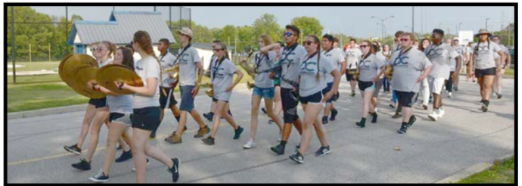
DCHS & 8th Grade Band marching during the Homecoming parade

This year's annual 8th Grade Band Night coincided with Homecoming. DMS 8th grade band joined the DCHS band for the Homecoming parade and helped provide music to support the football team during Decatur Central's 63 to 28 victory over Plainfield!