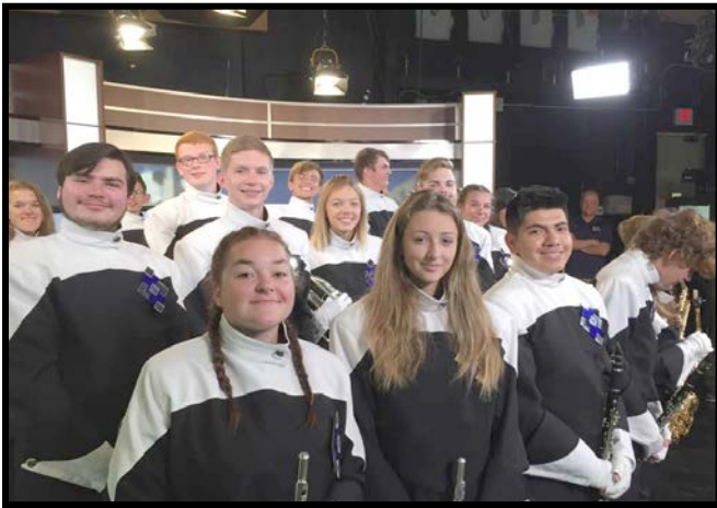
The band prepares to play during WISH-TV Day Break

On September 8th, DCHS Band was invited to play in studio during WISH-TV Day Break. The band arrived at the studio around 5:30am and started playing during segues between commercials from 6:15am-9:00am.