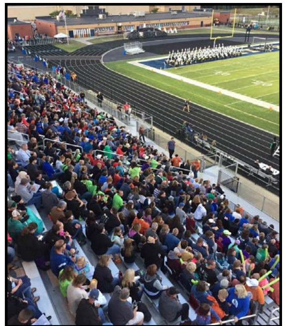
The stands were crowded with spectators as a band prepares to compete

DCHS Band Boosters hosted our annual "Contest of Champions" marching band invitational on September 9th. It was also the BIGGEST invitational we've hosted since we began the contest in 2014. By the end of the event it was standing room only. Over 20 bands participated, including several bands from all ISSMA classes. Since DCHS hosted the event, our band marched last and for exhibition and judge feedback only. This is a major fundraising event for the DCHS Band program and allows us to have some of the least expensive marching band fees in the area. Of course, none of this would be possible without the help and support of our band boosters. A special thanks to our contest team leaders, Juli Thomas and Gwen Spice-Winderlich for their leadership and helping to make this the most successful contest we've hosted.