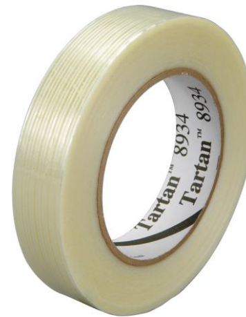
1" Wide Strapping tape-provided