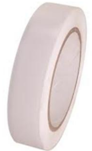
1" Wide White Vinyl Tape