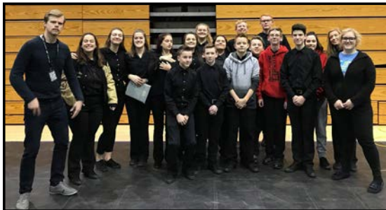
DOWN the LINE